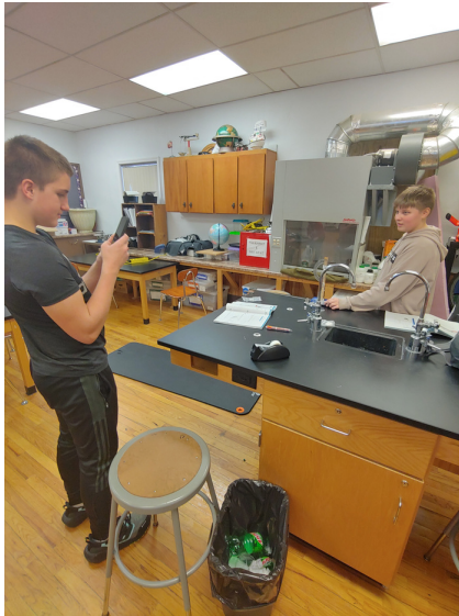
SCIENCE 8TH GRADE