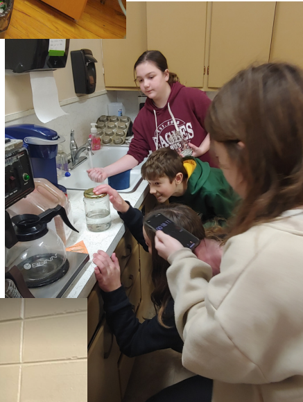
SCIENCE 7TH GRADE MELTING ICE