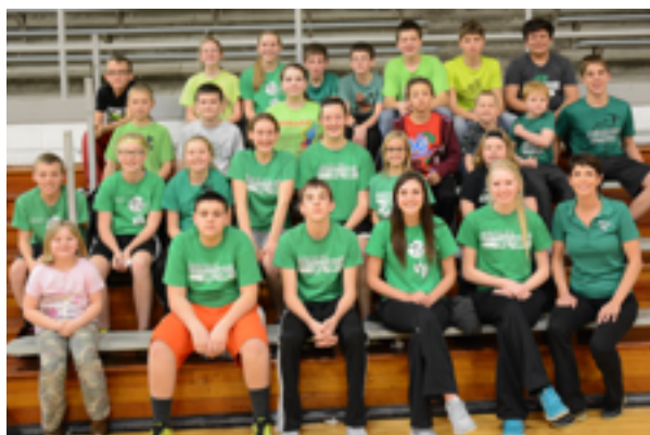
Bottom right picture: Winners of the poster contest.