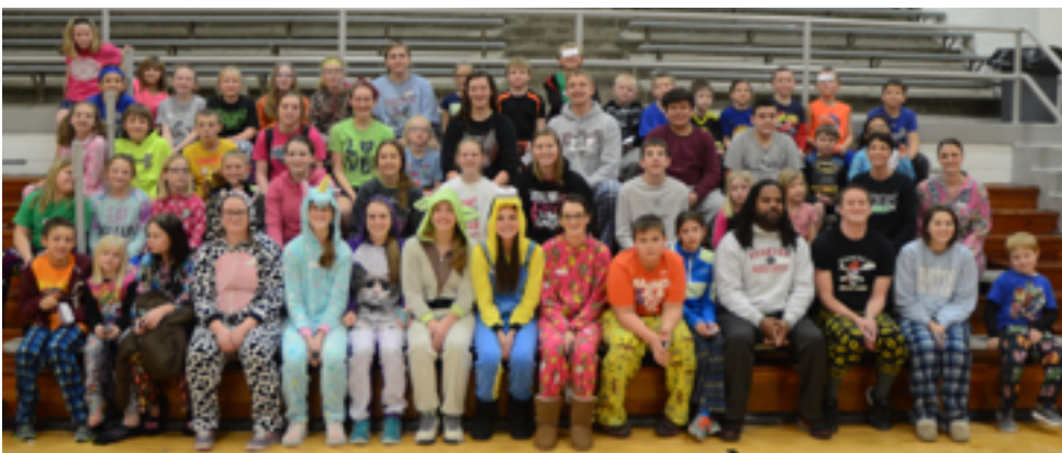
Top picture: Students and faculty member who wore pajamas and donated money to “Jammies for Babies.”

Members had a good time celebrating FBLA week and completing their activities!