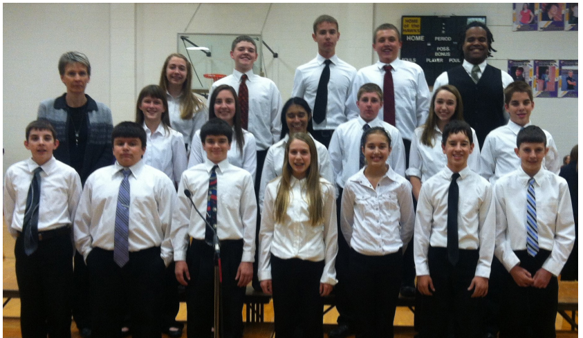
The Shickley Choir performed at the Crossroads Conference Junior High Vocal Clinic held at Hampton Public School. They performed 4 mass choir selections with nine other schools. The Shickley students also performed as their own choir by singing "The Water is Wide."