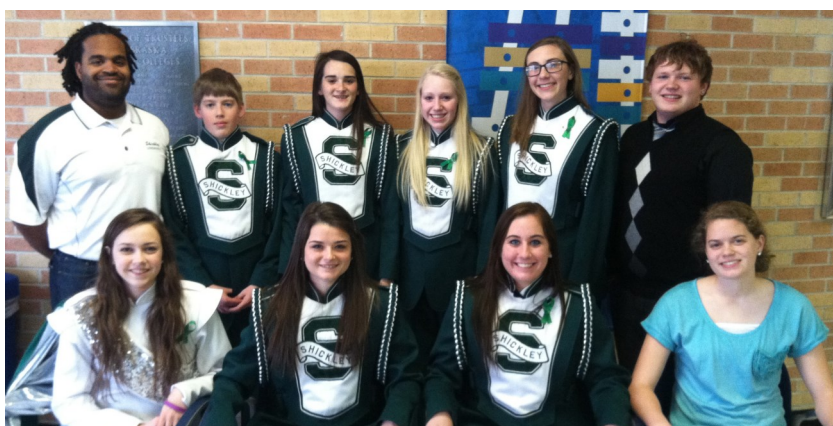
Class D All-State band took place on the UNK campus Saturday, March 22nd. Nine students were represented from Shickley across the three bands. The three ensembles comprised of around 150 students from all across Nebraska.