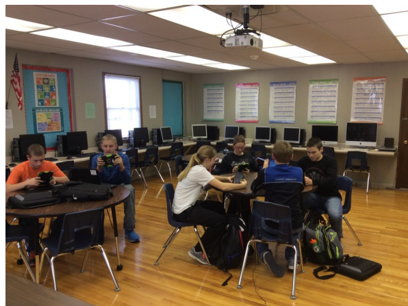
Freshmen Class using the iPads to work on Livebinders projects.

The Information Technology II class explores the variety of picture production and video apps available to showcase their IT Career Research Project.