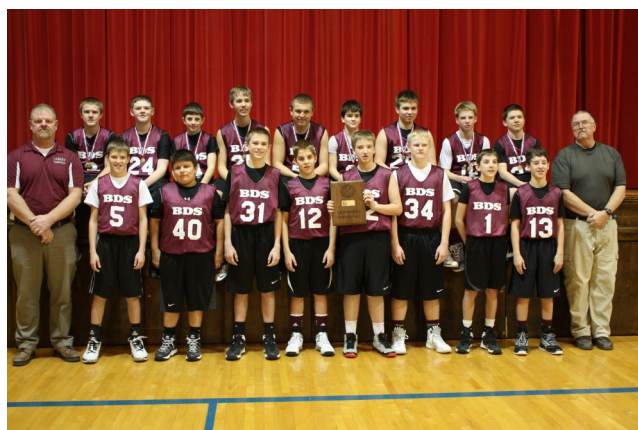
Above and Below: The CRC Jr. High basketball champions pose with their plaques.