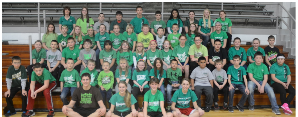
Right: Students wore green to show their support for FBLA's Go Green project.