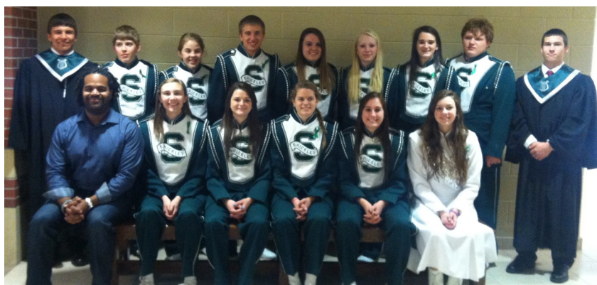
The Crossroads Conference honor band and honor choir took place on March 24th at the Edwin and Bernice Lock Theater in Central City. Fourteen students from Shickley participated in the two ensembles. Seven of the students were selected and performed in both the band and the choir.

Shickley Junior and Senior High Bands and Choirs performed a concert on Thursday, March 20th, at Shickley High School. Desserts were provided for those attending the concert by the Music Boosters. The music for the concert was all from popular genres over time. The High School Choir debuted their new choir robes, which were purchased by the Music Boosters and Shickley Public School.