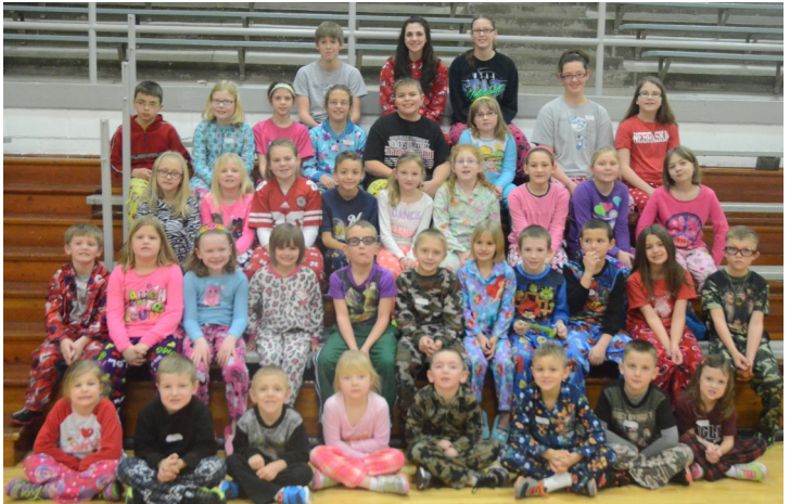
Students that dressed in pajama's for the day in support of the March of Dimes.

The special activities held this week included the “Jammies for Babies” fundraiser for the March of Dimes. Students and Faculty donated money to wear pajamas to school. This activity raised $124.50 for the March of Dimes. The FBLA chapter promoted their “Going Green” project by holding a poster contest for the 5th and 6th grades, sponsoring a Shickley recycling center trivia question, providing daily “Going Green” facts, and wearing green to school. Each winner received a Walmart gift card.