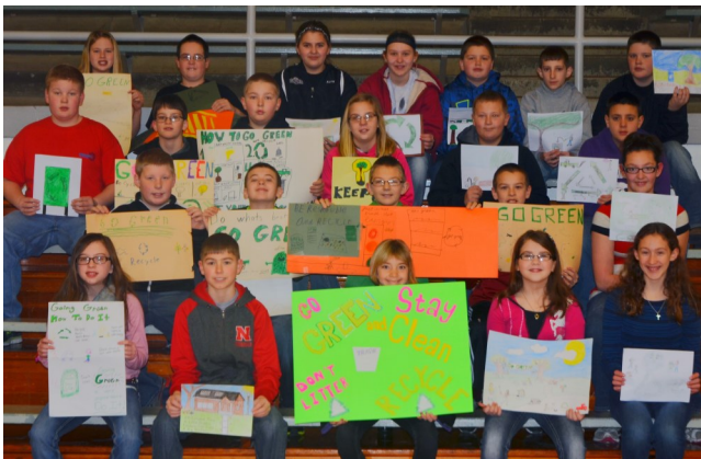
Left: Shickley 5th & 6th Grade students competed in the FBLA Week poster contest. They designed a posters promoting “Going Green”.