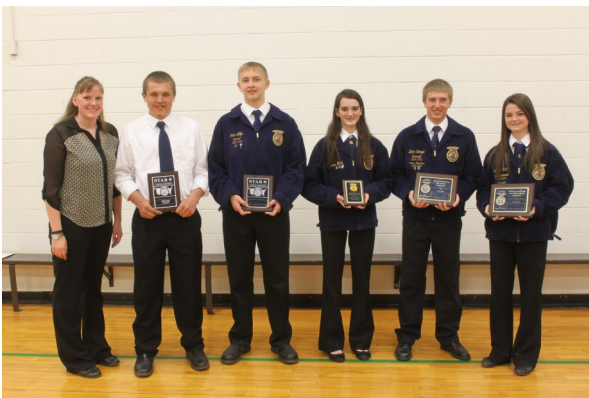
Shickley FFA Members received numerous awards at the 35th annual banquet. See related article on page 4.