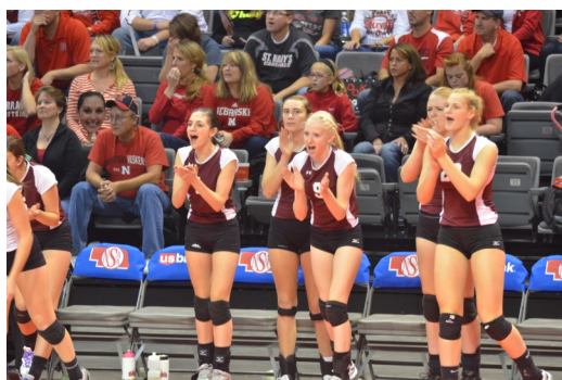
Team members on the bench cheering on their teammates.