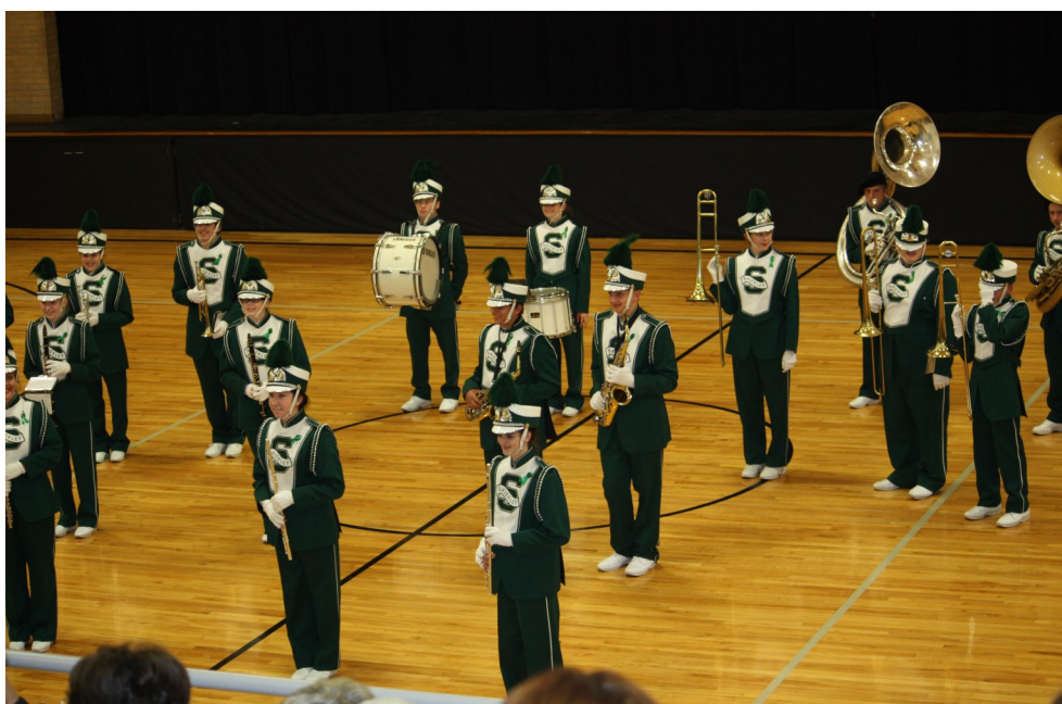
The Shickley High School band about to start the court show.