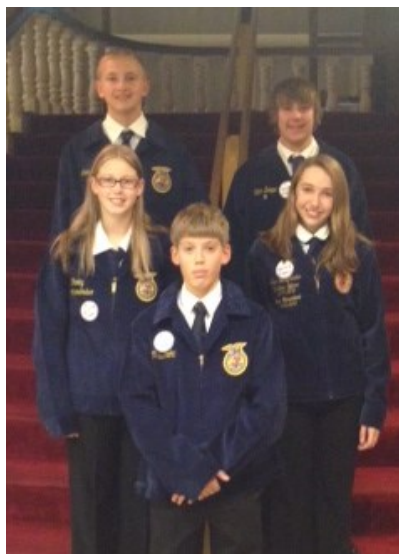
FFA Members before their session.

Students went on a tour through the Louisville Slugger Museum and were able to see how the famous bats were made. Members also saw the National AgriScience contest finalists' projects and ask the participants questions about their projects. It was a great trip and learning experience for the attending FFA members.