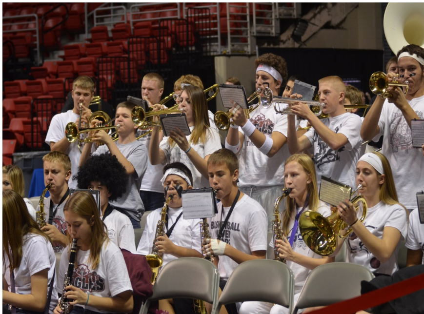
Our band members all in white at the last match of the Class D-1 State volleyball Championship, supporting the Lady Eagles.