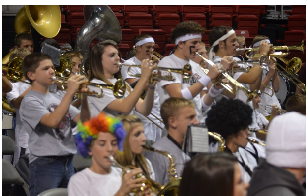
Between sets the pep band kept the crowd and the team fired up.