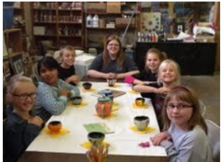
The third graders have a tea party using the pottery they made.

The 3 rd graders are doing a unit on Japanese Art. They watched a video about a real Japanese Tea Ceremony and discussed their traditions and customs. Next, students used the pinch pot method to create a teacup. They added a coil to the bottom to make a foot for their pot and “scored and slipped” the clay to make sure it was attached securely. Leaves were pressed into the clay because Japanese art is often based on nature. Japanese teacups do not have handles, so we left handles off too! After the art pieces were bisque fired in the kiln, students used dinnerware safe glazes to complete their projects. Finally, we had a class tea party to celebrate and invited Miss. Millnitz! Students had lemonade (because we don’t care for tea) and we read the book “DogKu” to learn more about Haiku poetry for our next project.