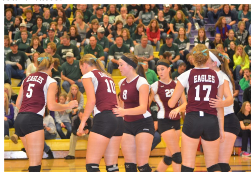
Varsity members getting ready for the match.