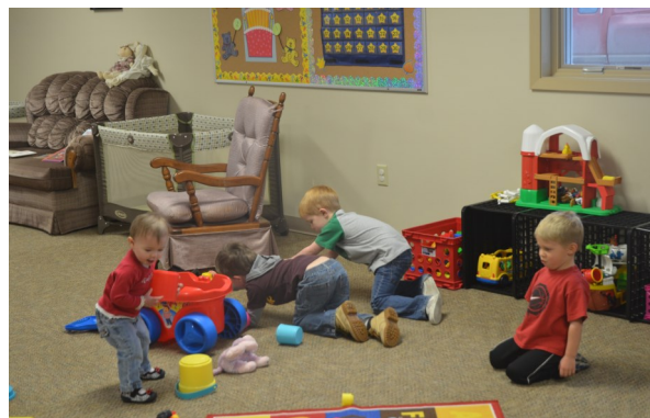
Above and Below: Children playing at the new daycare.

I am originally from Geneva, Nebraska and graduated from Geneva High School in 1981. I went to college at Kearney State College from 1981 to 1985. I majored in Elementary Education with an Early Childhood Endorsement. I taught 3 rd at District 60 in Hastings, NE for 2 years before moving to Texas., where I lived from 1987 to 1993. I was an executive secretary and underwriter during that time. My first son was born while I lived down in Texas. I moved back to Nebraska in 1993 to marry my current