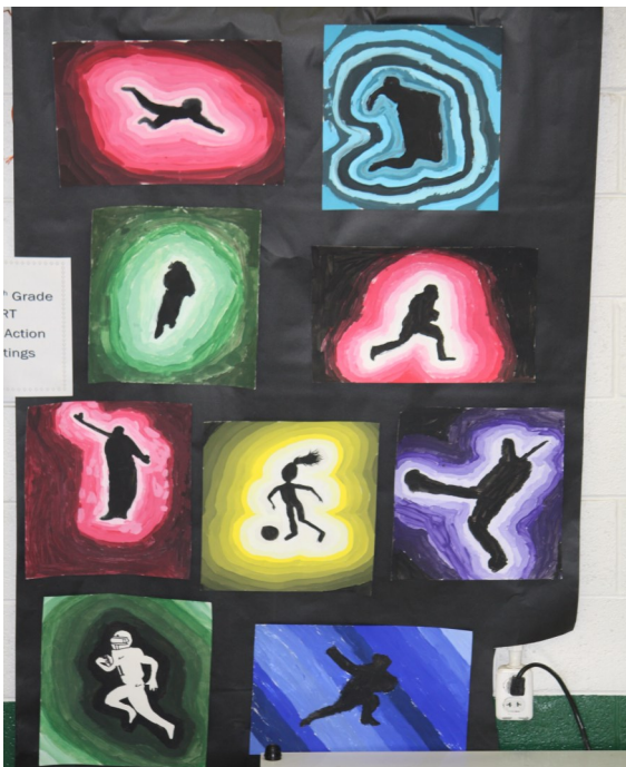
Action paintings done by 5th and 6th Graders