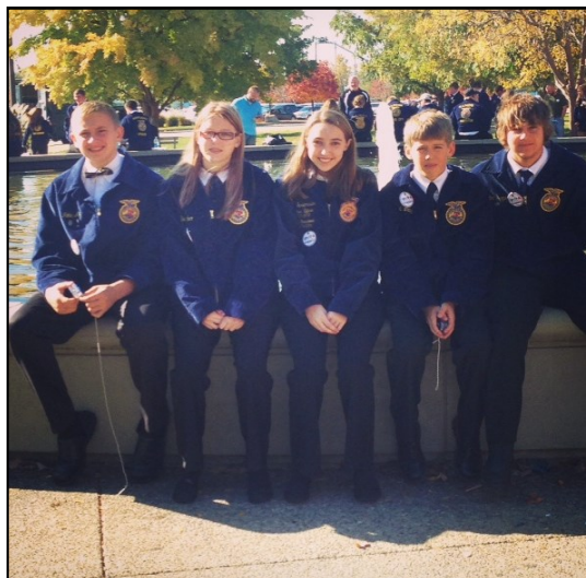
FFA members in front of the Expo Center in Kentucky