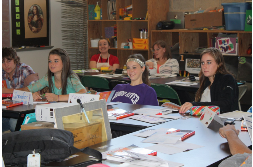
This photo shows students working in the new college readiness class.