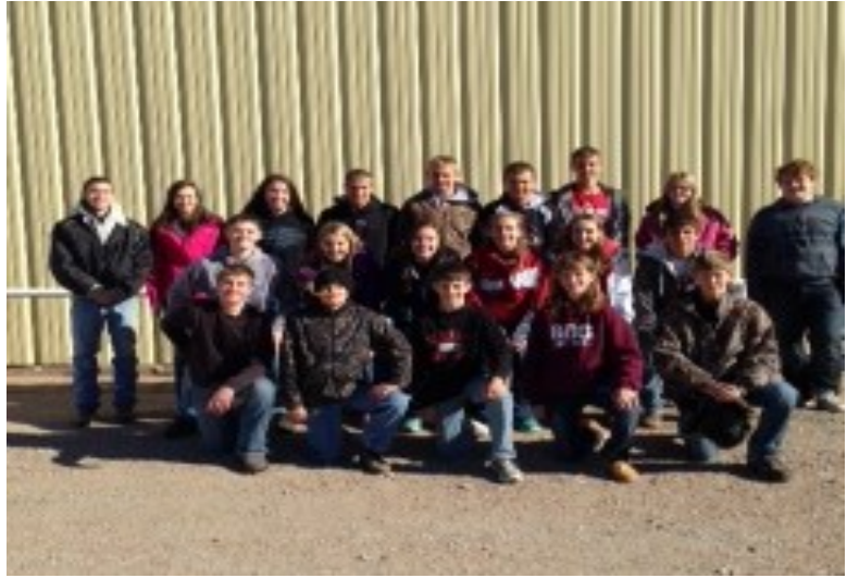
FFA members who attended the district VI Livestock Judging Contest in Hastings.