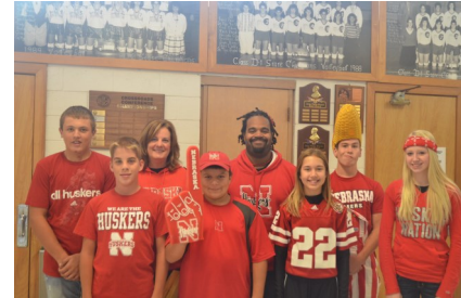
Super Fan Day