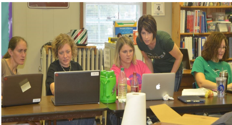
Teachers learning more about PD360

As the year goes on, and as time progresses, Shickley will begin to use PD360 for other uses like individual professional growth and development, team and grade-level development, and collaboration with other teachers in the area, state, and across the country.