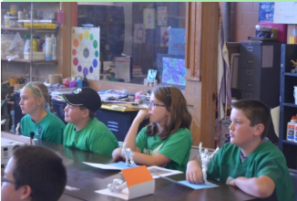
Sixth graders listen intently before working on their art projects.