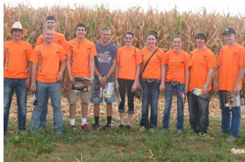
FFA members who attended Husker Harvest Days

majors. The students received a t-shirt for participating and were able to see the different vendors.