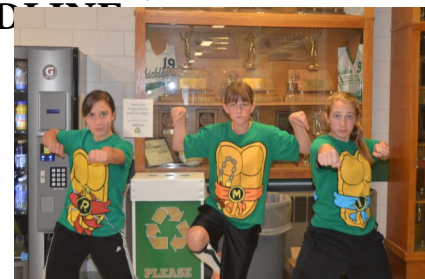
Random Costume Day