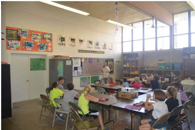
Above: The newly remodeled art room is used by the 4th grade. The other half of the room is now used for storage.