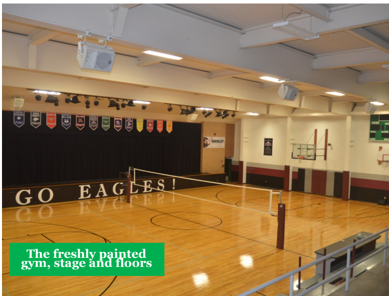
The freshly painted gym, stage and floors