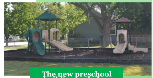
The new preschool building and play-