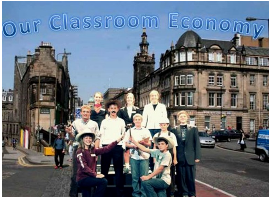
The 8th grade class really got into their roles in the Classroom, so much that they dressed to match their career.