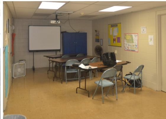
Top Right: The Ag room is painted and ready for class.