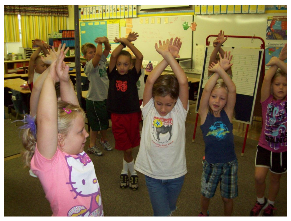
The 1<sup>st</sup> graders boogied to learn. See related article on page 6.

"There are no traffic jams along the extra mile." Roger Staubach